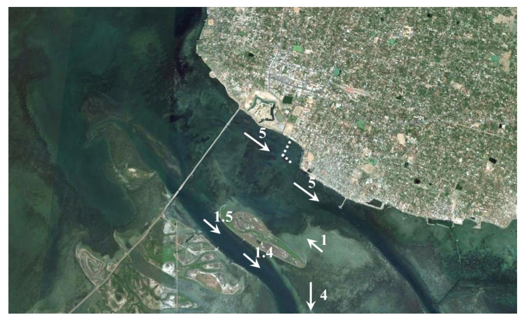
Figure E2. Annual Sediment budget at Gurunagar - white arrows, unit 1000 m3/year. White dashed lines represent the proposed harbour breakwaters (not included in model).