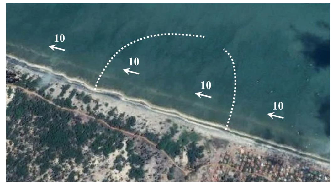
Figure E1. Annual Sediment budget at Pesalai – white arrows, unit – 1000m^3 /year. White dashed lines represent the proposed harbour breakwaters (not included in the model).