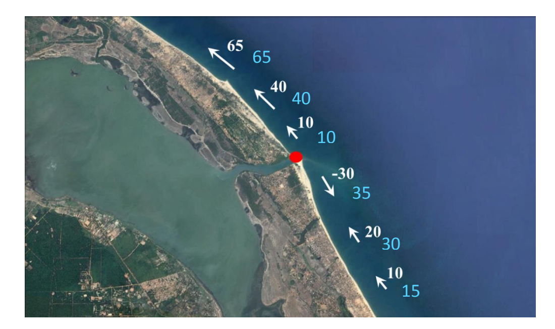
Figure E4. Sediment budget at Mullaitivu – white arrows and numbers show net longshore transport. Gross sediment transport rates are shown in blue numbers, unit – 1000m^3 /year. The red circle shows the earlier proposed harbour location.

Based on the above results, prevailing field conditions and careful consideration of the conceptual designs for the proposed harbours, the below follow-on actions are recommended: